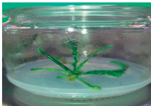
Figure 4. Shoots in MS medium, Filip variety with vitrification state