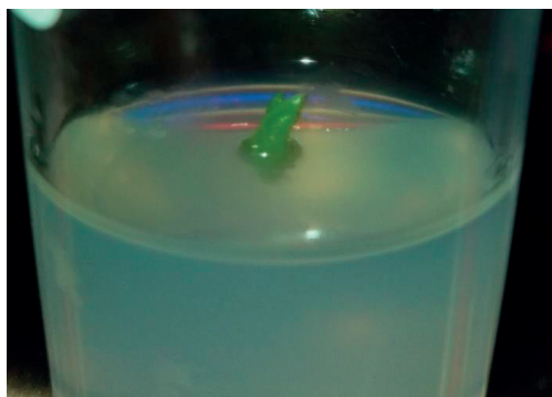
Figure 3. Shoot Mimi variety in QL medium (vitrification resistance of 95%)

In this process, many compounds are produced, including "melanin", which is a pigment characterized by a dark colour and causes the colour of the media as well as the explants to turn brown, and an increase in this substance leads to stopping or impeding the growth of the plant and may lead to its death (Banerjee et al., 1996; Murata et al., 2001; Wu and Lin, 2002; Aquino-Bolaños and Mercado-Silva, 2004; Yari Khosroushahi, 2011).