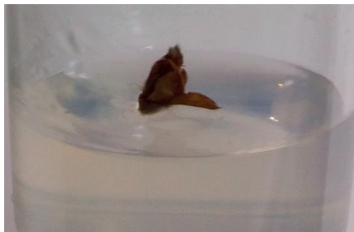
Figure 2. Loss of explant after one week from culture due to reactions of phenolic substances (Florin variety)

superoxide dismutase and peroxidase are released into the affected part of the plant. These enzymes work to maintain plant tissues by catalysing various reactions for the purpose of eliminating reactive oxygen and thus healing the plant (Titov et al., 2006).